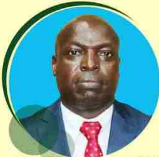
Ag. Managing Director - Kenya Seed